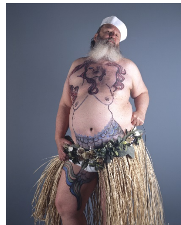
Evergon, Crossing the Equator, Going South, Pacific Rim #03 , 2009, digital print on paper, 41 x 30 cm. City of Ottawa Art Collection.