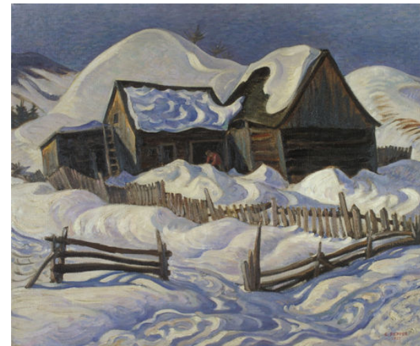
George Pepper, Old Barn, Quebec St. Urban, Baie St. Paul , 1937, oil on canvas, 64.1 x 54 cm. Firestone Collection of Canadian Art, the Ottawa Art Gallery. Donated to the City of Ottawa by the Ontario Heritage Foundation.

Get creative at home this Family Day with a special wintery craft inspired by paintings from the Firestone Collection of Canadian Art. Using household items, you can create a textured winter landscape with fluffy white snow!