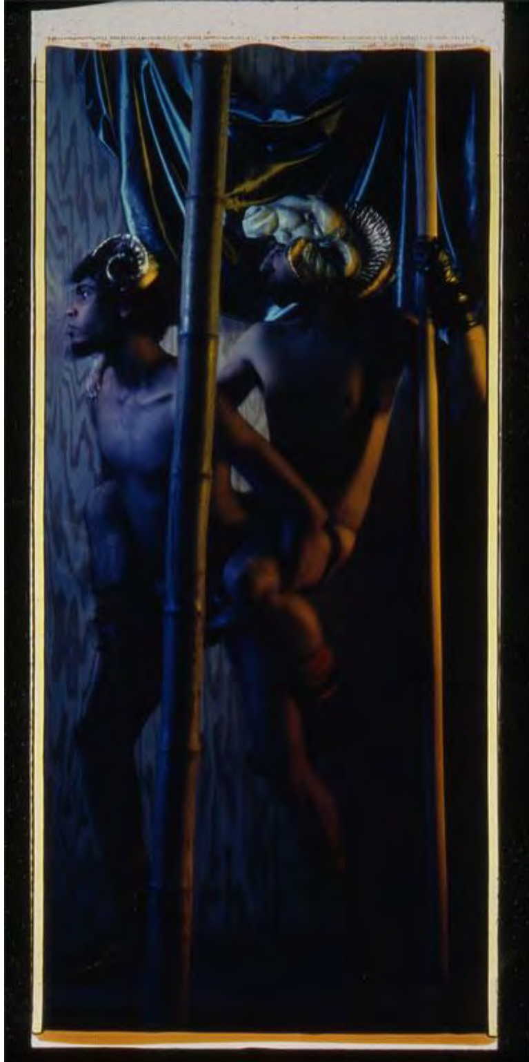
Evergon (he/him), Night Watch II , 1990 Polaroid Photograph

Currently on view in the exhibition Art School Confidential (April 20, 2024 – Sept. 22, 2024) at the OAG.