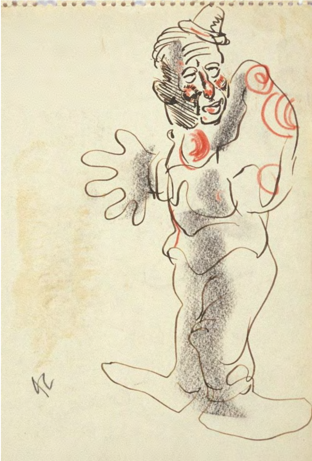
Arthur Lismer (he/him), A.Y. Jackson as Clown, II , 1955, ink, pencil crayon and charcoal on paper.

Firestone Collection of Canadian Art, the Ottawa Art Gallery. Donated to the City of Ottawa by the Ontario Heritage Foundation.