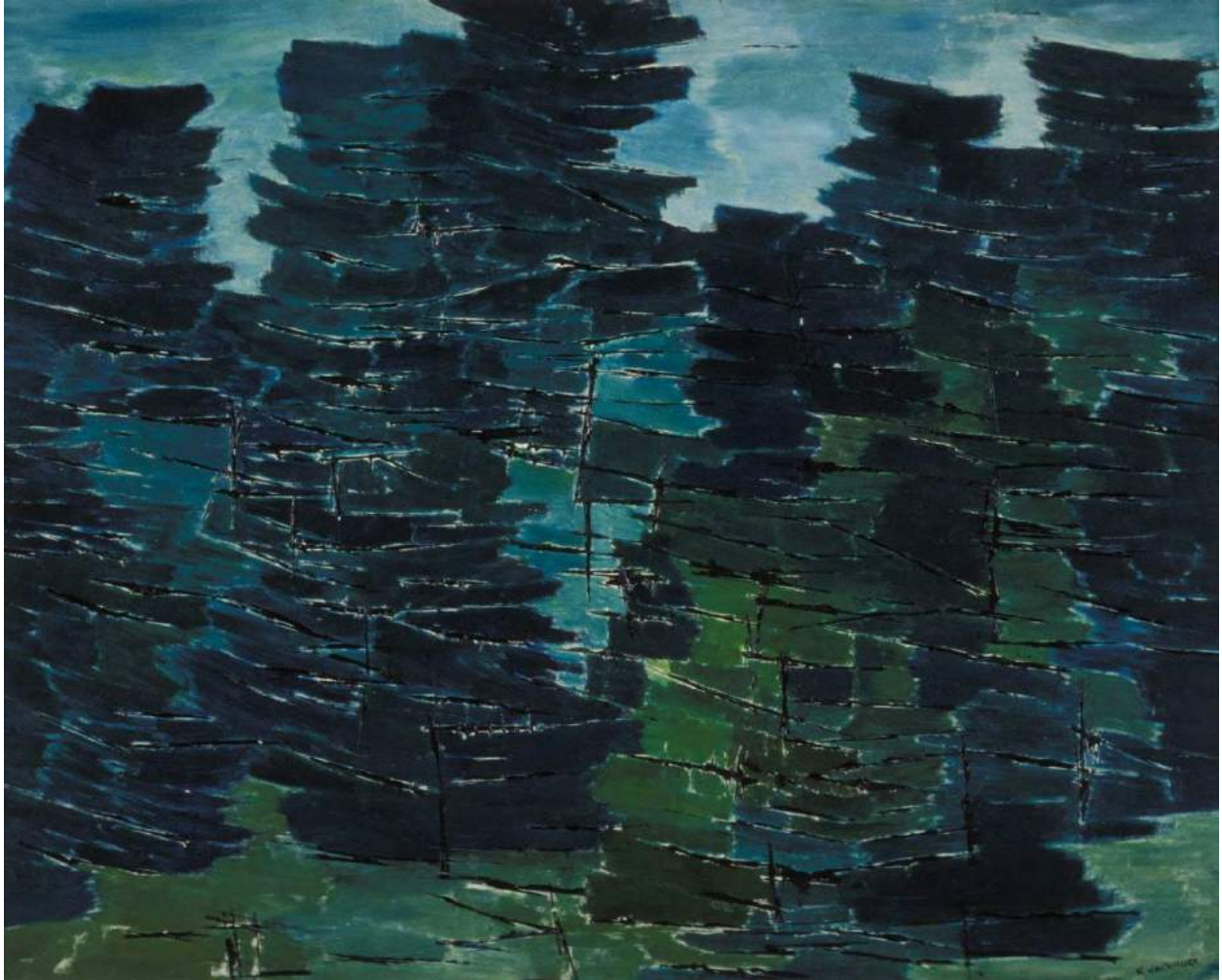
Kazuo Nakamura (he/him), Evergreen , 1958, oil on masonite.

Firestone Collection of Canadian Art, the Ottawa Art Gallery. Donated to the City of Ottawa by the Ontario Heritage Foundation.